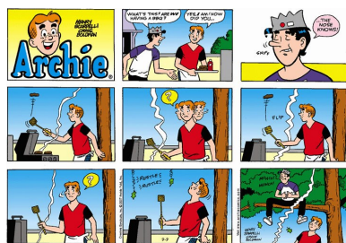
Copyright © 2007 Creators Syndicate, Inc.